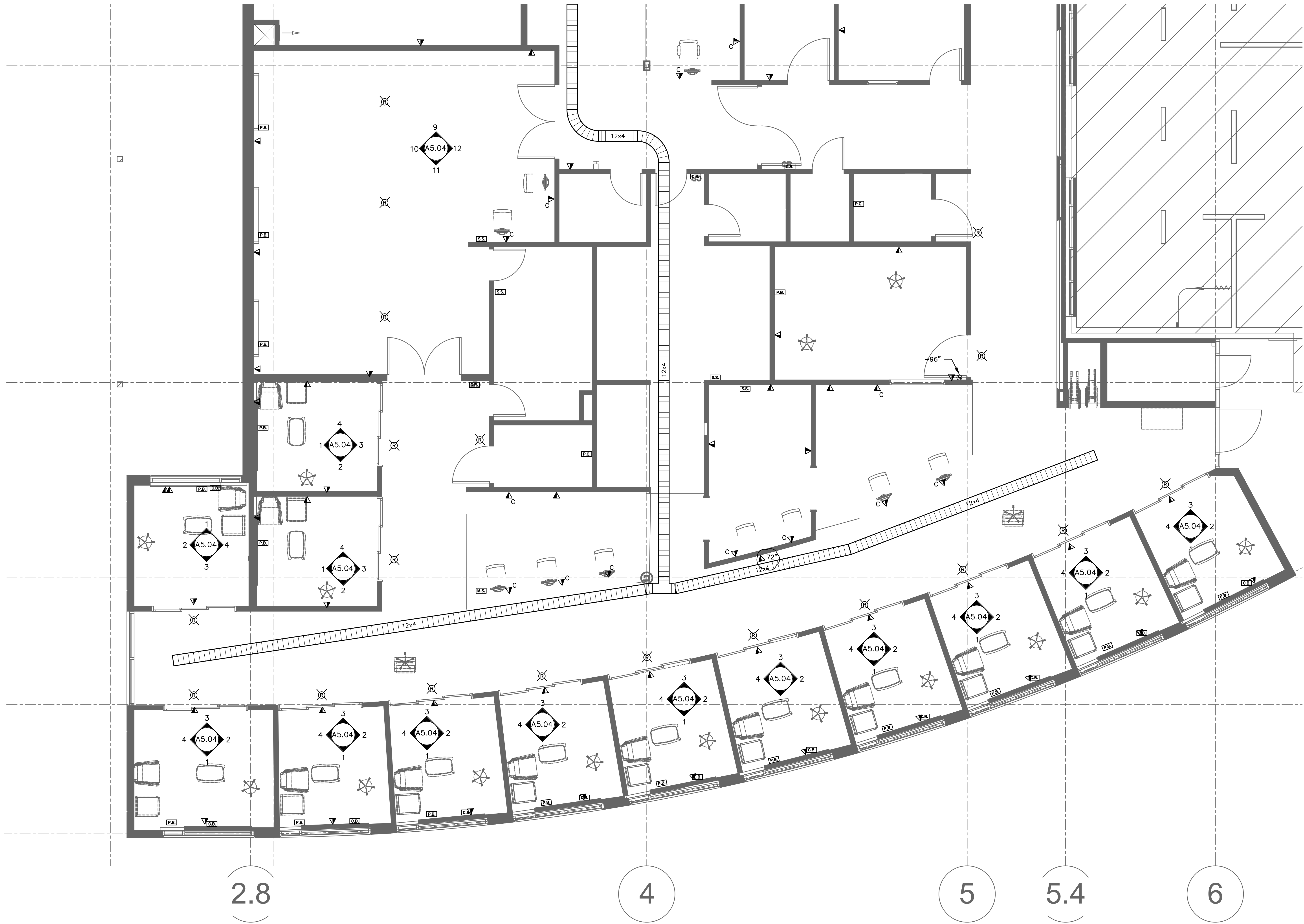
1 PARTIAL FLOORPLAN - TELCOM T3.14 SCALE: 1/4" = 1'-0"